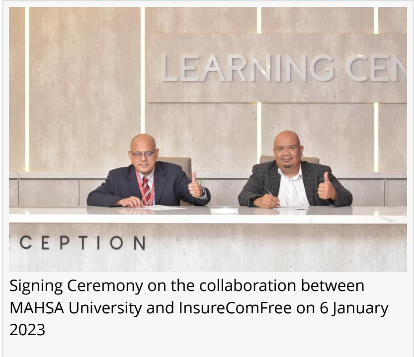
Signing Ceremony on the collaboration between MAHSA University and InsureComFree on 6 January 2023

KUALA LUMPUR, MALAYSIA, February 9, 2023 /EINPresswire.com/ -- Malaysia-based insurtech InsureComFree a leading insurtech in product development has expanded its cyber risk program to include university students designed with the tertiary students in mind addressing the concerns on inappropriate content sharing, overshared information on social media, or faced hacking or cyber bullying and pose a grave threat to the safety of its students.